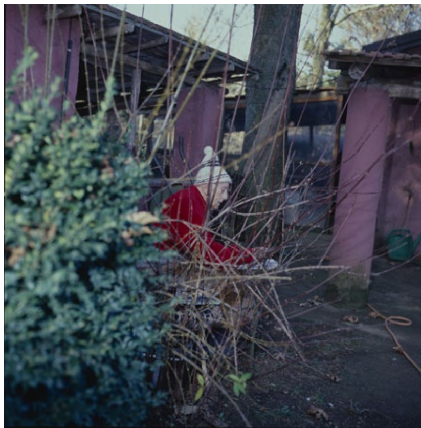
Alain Daniélou at the Labyrinth, Zagarolo