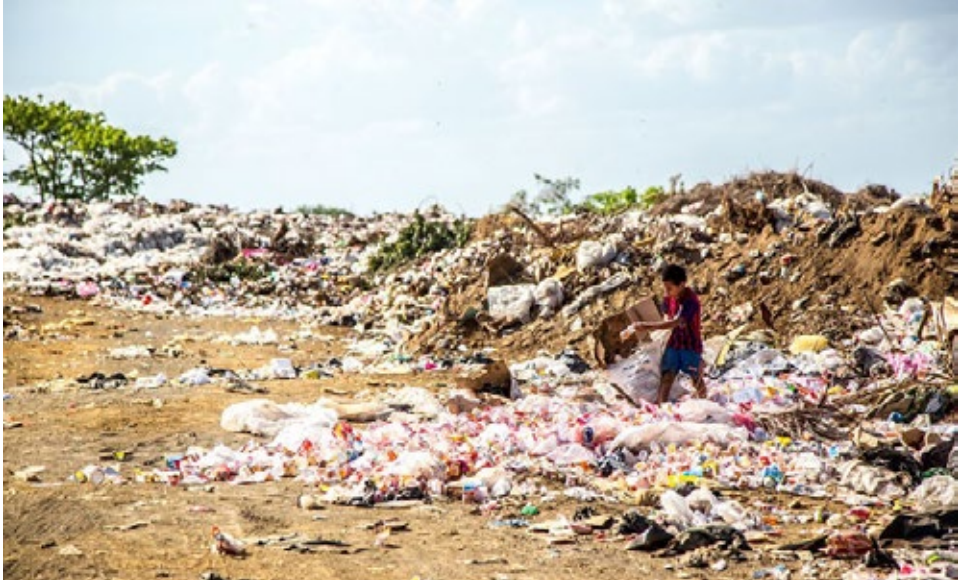
An apocalyptic image of Nature turned into an industrial garbage can

periority of the white race, its civilization and religion, was considered as an indisputable fact in Europe. It needed the excesses of Nazism to challenge this assumption.