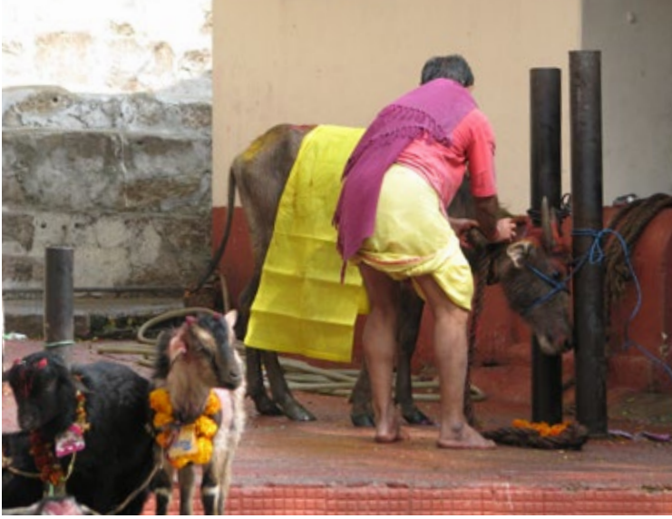
Preparation for the buffalo's sacrifice (Kāmākhya, 2016,)

eroticism related to womanhood, sexual fluids, and specific sexual prescriptions (including their violation) with the death imagery. Indeed, when Naraka was born he was found by his step-father, the king of Mithilā, 14 Janaka, on his sacrificial ground, “lying and crying inside a human skull” 15 .