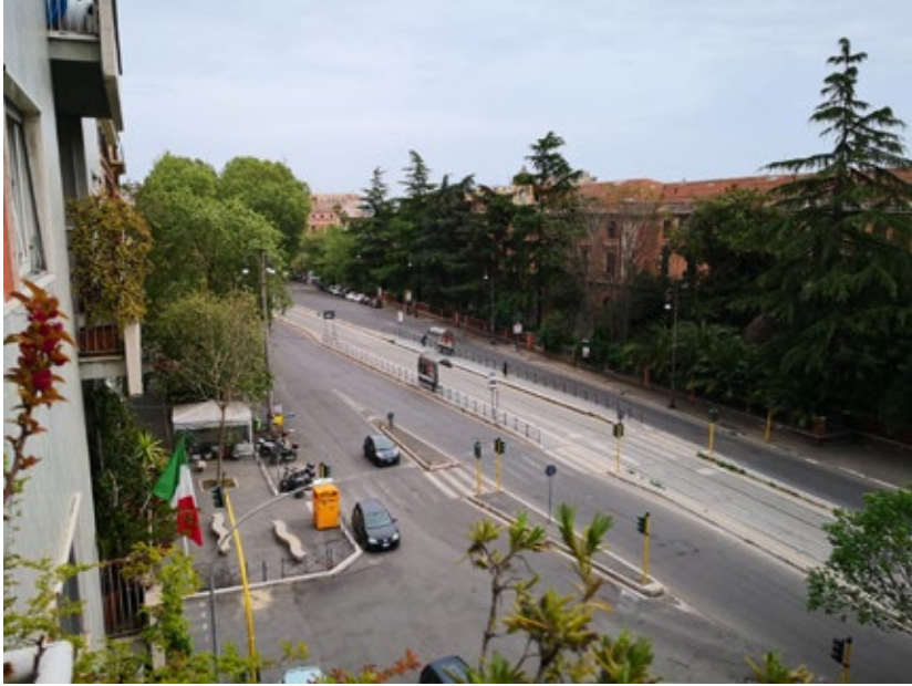
Human action in retreat, new possibility for ecosystems. An emptied Piazza Ippolito Nievo in Trastevere, Roma

(or spiritual) expression comes afterward. Daniélou wrote Shiva and Dionysus in the hope that humans would not become oblivious of Nature – which they bear within themselves, albeit on a conscious level fully detached and alienated from it. Rather in the programmatic line of Mircea Eliade (despite many conceptual differences), he declares the possibility and the urgency of a new humanism , the main condition for which is of fairly difficult realisation: humans must renounce the conviction that they are the crown of creation if they wish to gain true wisdom. A return to Nature is something very different from the superficial forms of eco-sophical community-thinking or shallow and individually-oriented spiritual surrogates of institutional religions. For Daniélou this means regaining forms of wisdom related to cultures unsevered from the powers of Nature and the operative knowledge to deal with them in the best possible way. This is why the Shaivism of Daniélou is a construct, but a