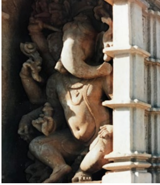
Gaṇapati, Destroyer of Obstacles

with ears like winnowing baskets, clad in red, his limbs are anointed with red sandal paste. He is worshipped with red flowers. Merciful to his devotees, he is the infallible deity, origin of the worlds. He appears in the beginning of creation beyond Nature, beyond the Cosmic Person. He who ever meditates on his form becomes great among the reintegrated” (Gaṇapati Upaniṣad 11-14).