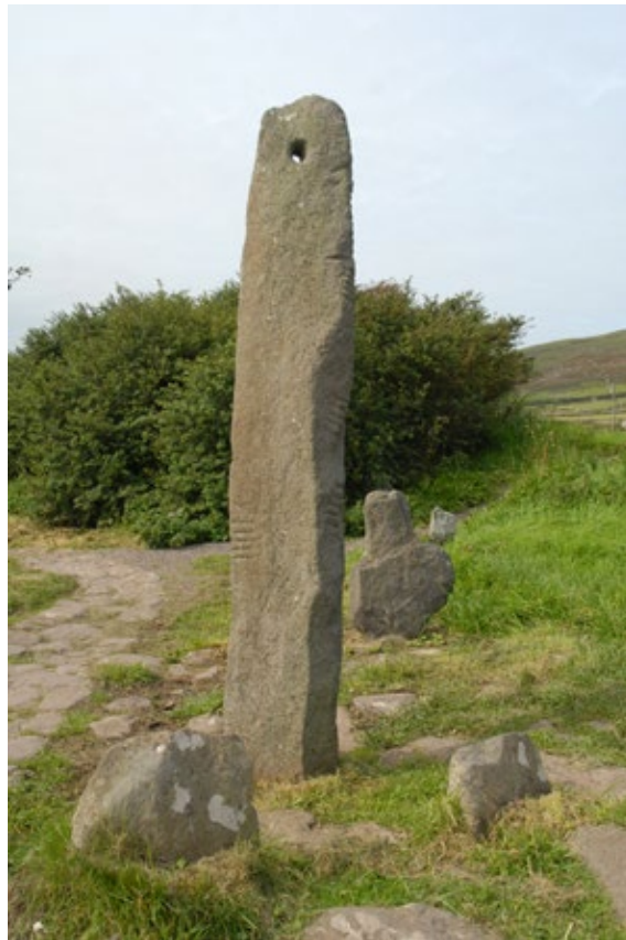
The writing of the Ancient Celts cannot be understood as a vehicle, but as a sacred act. The Druids used writing only to transmit their knowledge. Stone with oghamic inscription at Kilmakedar, Ireland

The most significant heritage of Druidism thus consists of three elements that are coherent throughout western Europe: the network of holy places, the calendar of feasts, and rites, which support the theory of a sacred geography and a continuum. •