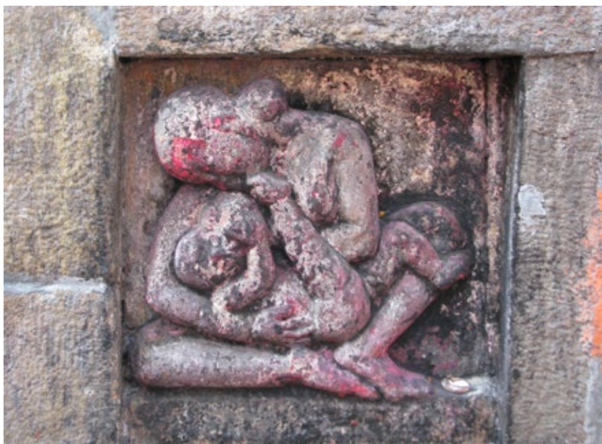
Mother feeding her child (Kāmākhya, 2016)