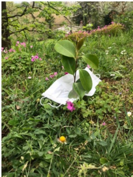
Corona virus as the force of Nature piercing the alienating masks of human beings

of Hindu Neo-Vedānta, the main challenge of the XXI century seems to be Neo-shamanism. The reason is simple: the message of Neo-Vedantic gurus revolved around the possibility of finding and realising God within ourselves, that is, without the mediation of an institution (the Church) that had lost much of its binding spiritual power for most followers. Neo-Shamanism is mainly the reception of indigenous traditions in the context of an uprooted and eclectic spirituality. But its scope includes the new efforts of Western science (from ethnology to psychiatry) to change its parameters of understanding and action through an open dialogue with tribal cultures. Both aspects of this phenomenon have been triggered by a collective perception of the terrible situation in which human beings find themselves after being completely severed from all forms of wisdom based on knowledge of and relations with the non-human environment (from plants and animals to spirits and gods). If the