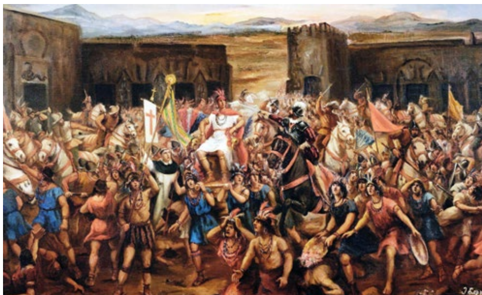
Juan Lepiani, Capture of Atahualpa, around 1920-1927