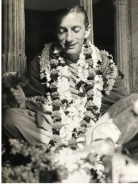
The young Alain Daniélou in India around 1940