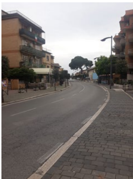
Desert urban landscape. Tor Lupara, Northeastern periphery of Rome

their devious and dangerous amalgamation of method and content), share a common presupposition as to the place of human beings in the world. These intrinsically different trends (from which different world-perspectives have historically arisen) affirm the superiority of spirit over nature due to a qualitative difference between the interiority (and profoundness) of the human and the exteriority (or shallowness) of so-called ‘natural life forms’. Daniélou affirms, on the contrary, the inter-relatedness of humans and non-humans, the non-duality of body and soul, as well as the presence of an energy-source encompassing all Life forms – not as a reductive unity, but as a self-expansive diversity. The expression ‘body of Shiva’, which Daniélou uses in Shiva and Dionysus , is in this sense to be seen as a never-fully-grasped field of forces – a small part of which we know; a great part of which we don’t know. What is the message of Shiva and Dionysus ? Humans should make a humble but vehement effort to