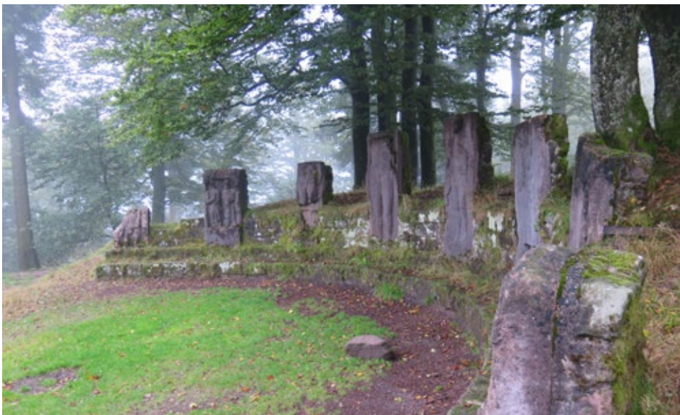
Celtic sanctuaries were built on exceptional sites: islands, estuaries, summits, plateaux, forests: here, the steles of Gaulish deities on Mont Donon, in the Vosges