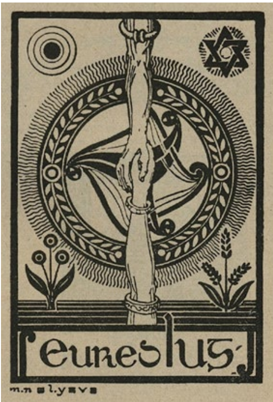
Woodcut of the Feast of Lugnasad, Euredlug, Raffig Tullou, Celticist Journal Kad, 1959

About sixty toponyms relative to mediolanum - which can be translated as "centre of perfection" - have been listed on the continent. Their locations reveal the geographic isolation of