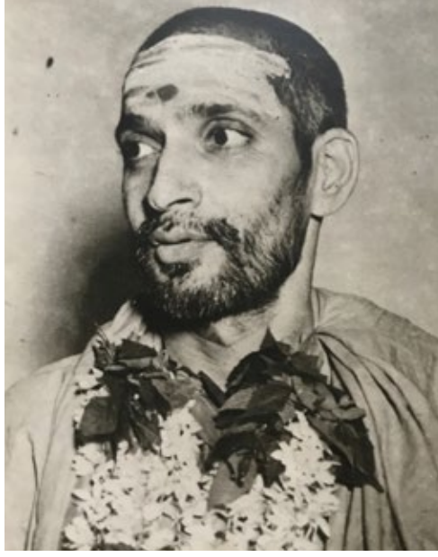
Swami Karpatri in the 1940s, on whom some of Daniélou's considerations on Ganesha are based