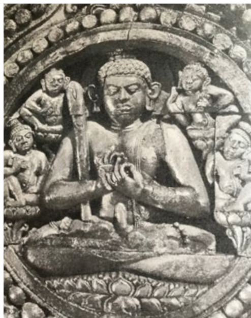
Shiva in Yoga posture, Bhuvaneshwar, Orissa IX Century

banishing the fear of death, but there is no point in insisting on that kind of relativity as if the immediate fact has no importance, because it has.